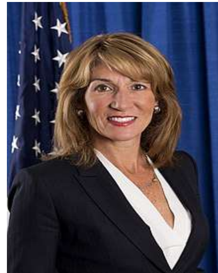
Lieutenant Governor Karyn Polito (Shrewsbury)