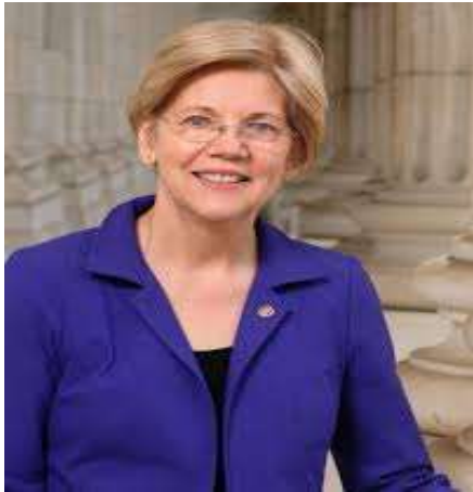
US Senator Elizabeth Warren