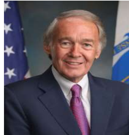
US Senator Edward Markey