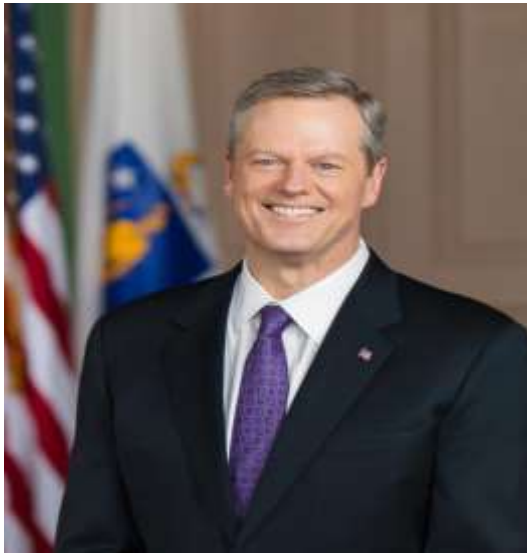
Governor Charlie Baker (Swampscott)